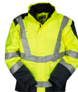
FLUORESCENT YELLOW/NAVY BLUE