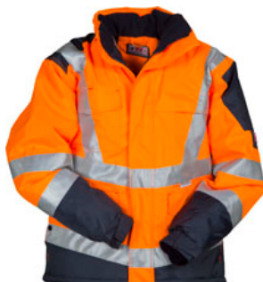
FLUORESCENT ORANGE/NAVY BLUE