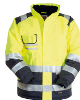
FLUORESCENT YELLOW/NAVY BLUE