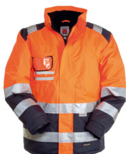
FLUORESCENT ORANGE/NAVY BLUE