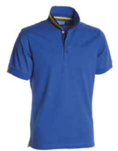
ROYAL BLUE/YELLOW- NAVY BLUE