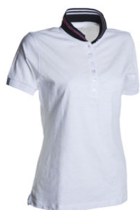
WHITE/NAVY BLUE-PASSION RED/WHIT WHITE/FLUORESC E-FLUORESCENT NT FUCHSIA YELLOW