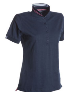
DENIM BLUE/WHITE- FLUORESCENT FUCHSIA