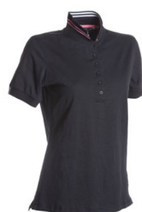
BLACK/WHITE- FLUORESCENT FUCHSIA