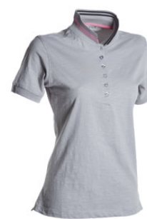
LIGHT GREY/BLACK FLUORESCENT FUCHSIA