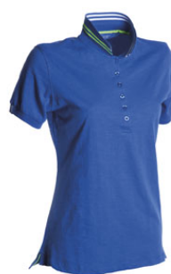
NAUTICAL ROYAL/ WHITE- FLUORESCENT YELLOW