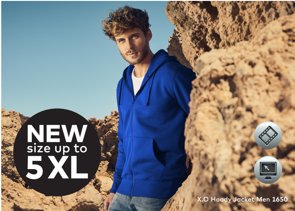
X.O Hoody Jacket Men 1650