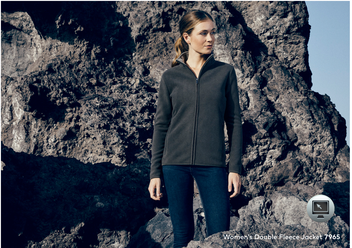
Women's Double Fleece Jacket 7965

Double fleece jacket with stand-up collar and full-length zipper, sleeve cuffs with elastane as well as side pockets with zipper. The inside of the jacket is in contrast colour, produced of polyester with anti-pilling finishing both sides. The fleece jacket has a slimmer cut.