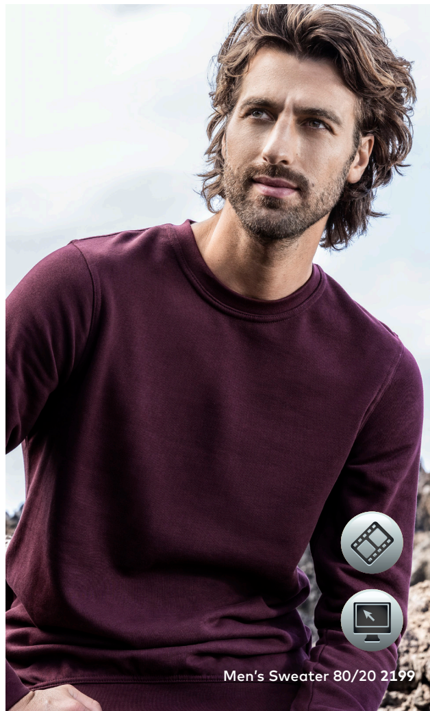
Men's Sweater 80/20 2199

Classic molton mixed fabric sweatshirt, molton brushed inside, with elastane in neck, sleeve cuffs and waistband, produced of combed cotton with polyester. The sweatshirt has a modern cut.