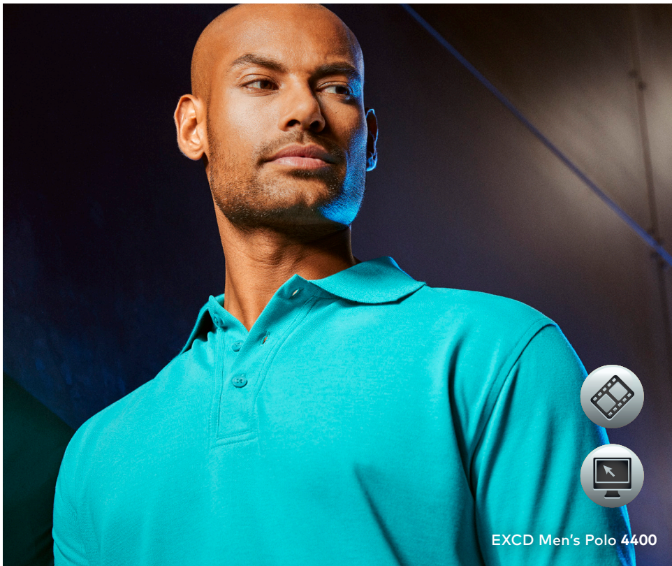
EXCD Men's Polo 4400