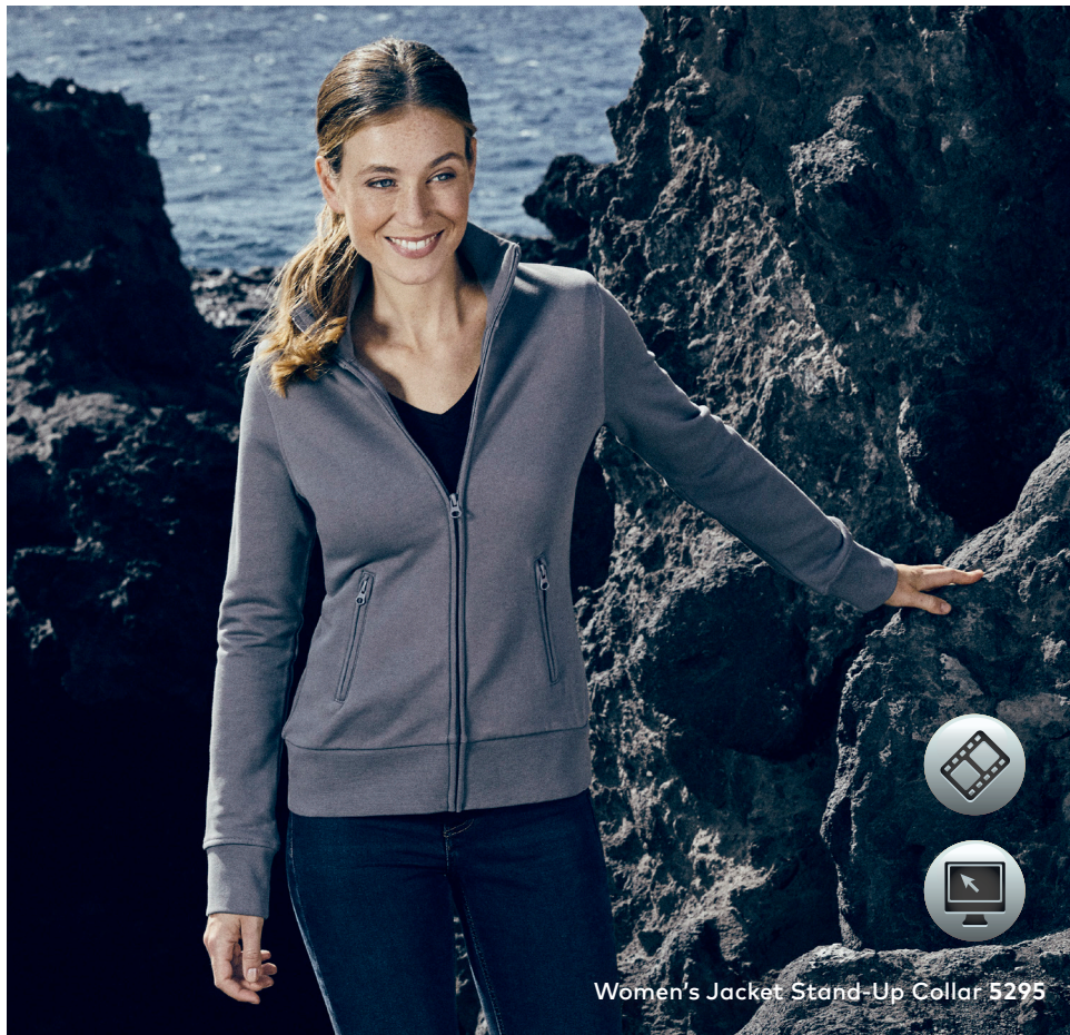
Women's Jacket Stand-Up Collar 5295