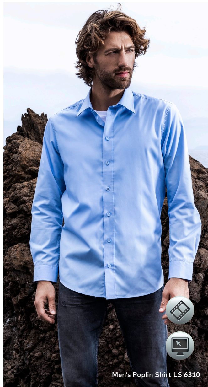
Men's Poplin Shirt LS 6310

Classic poplin long sleeve mixed fabric shirt with reinforced kent collar and button panel with tone-in-tone buttons as well as a separate chest pocket and spare buttons. The specific features of this shirt: easy care mixed fabric, darts front and back for women, adjustable 2-button cuff (barrel cuff), long sleeve placket with button, double back yoke, curved hem, produced of combed cotton with polyester. Classical single packing.