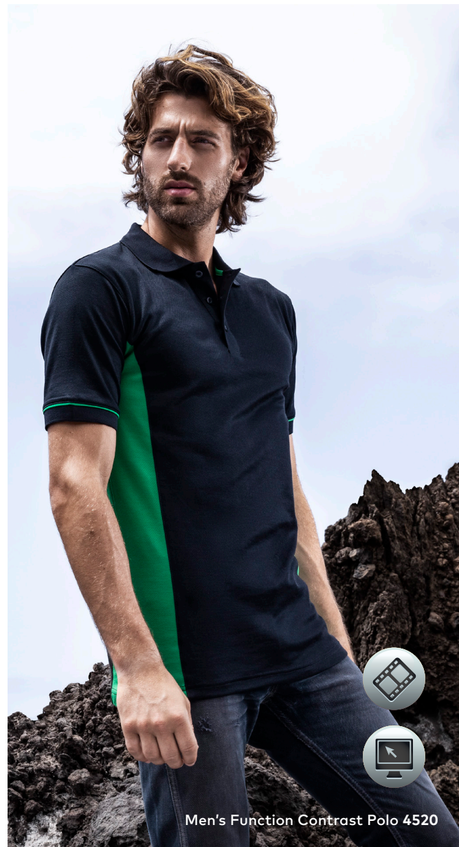
Men's Function Contrast Polo 4520

Functional mixed fabric interlock polo in piqué optic with button panel and 3 tone-in-tone buttons, sleeve cuffs with contrast piping and side panel in contrasting colour as well as side slits. The specific features of this polo: skin friendly, quick dry, absorbent, produced of combed cotton inside and polyester outside. The polo has a modern cut.