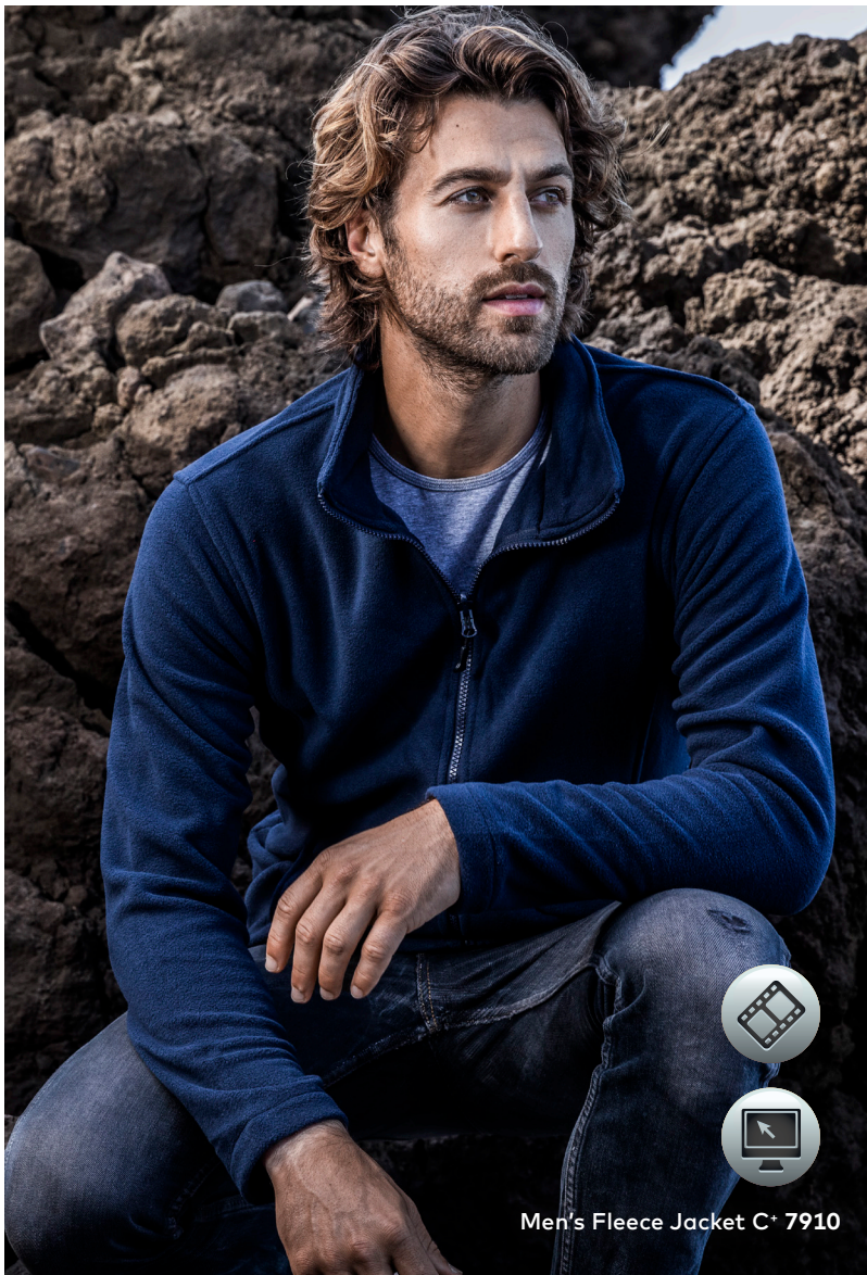
Men's Fleece Jacket C + 7910