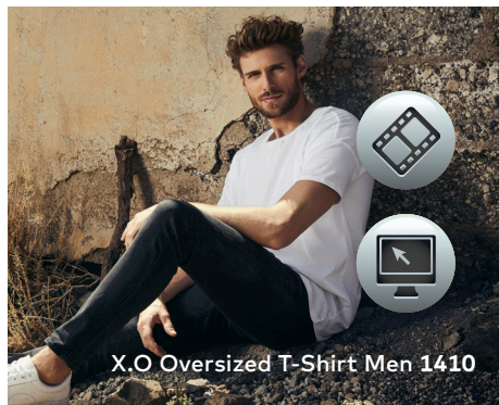
X.O Oversized T-Shirt Men 1410

Unique oversized single jersey T-shirt with self-fabric collar, made from long staple combed cotton. The particularly smooth surface and flowing fabric give the shirt a unique, elastic and silky finish. The T-shirt has an oversized cut and is made with side seams.