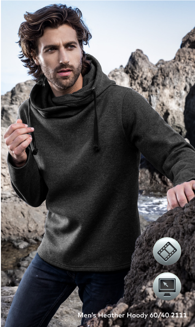
Men's Heather Hoody 60/40 2111