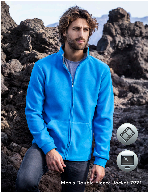
Men's Double Fleece Jacket 7971