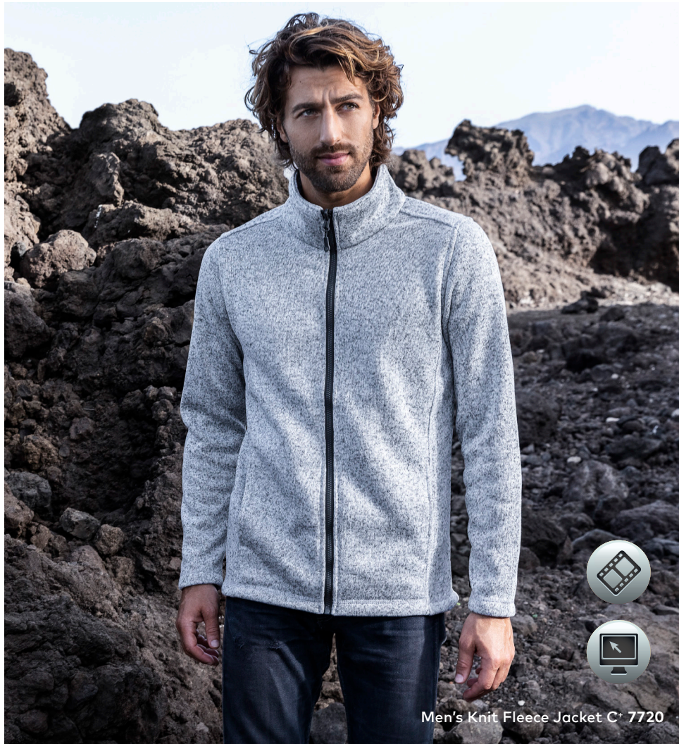
Men's Knit Fleece Jacket C + 7720