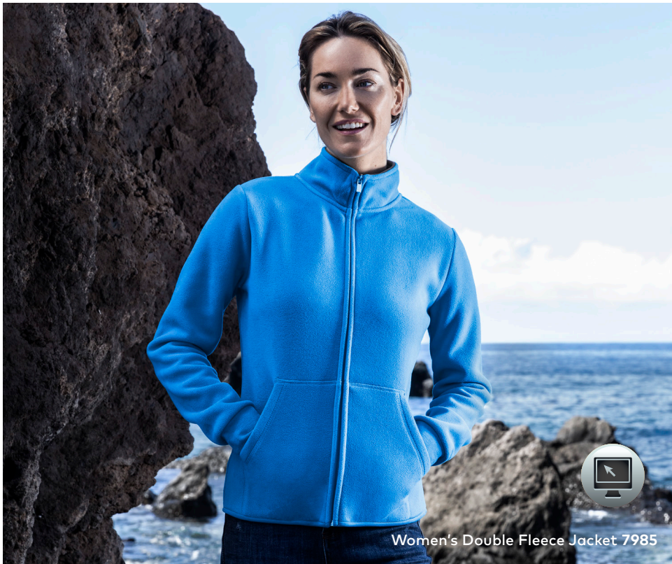
Women's Double Fleece Jacket 7985

Double fleece jacket with stand-up collar and full-length zipper, sleeve cuffs with elastane as well as slit pockets with decorative stitching. The inside of the jacket is in contrast colour, produced of polyester with anti-pilling finishing both sides. The fleece jacket has a slimmer cut.