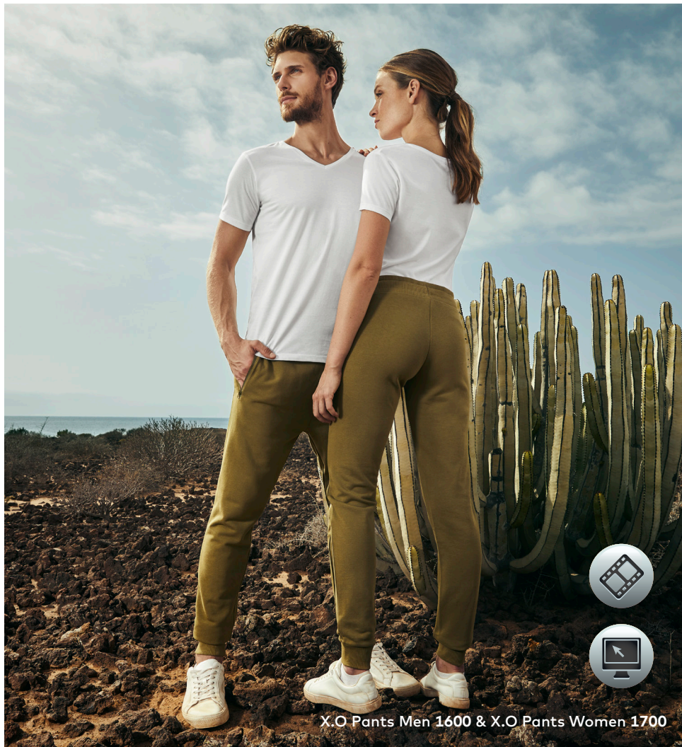
X.O Pants Men 1600 & X.O Pants Women 1700

Unique molton blend sweatpants, unbrushed, waistband with drawstring, 2 side pockets with coated tone-on-tone zip, elastane cuffs at waistband and leg hem, made of long staple combed cotton and polyester. The extra smooth surface and flowing fabric give the sweatpants a unique, elastic and silky finish. The sweatpants have a slim fit.