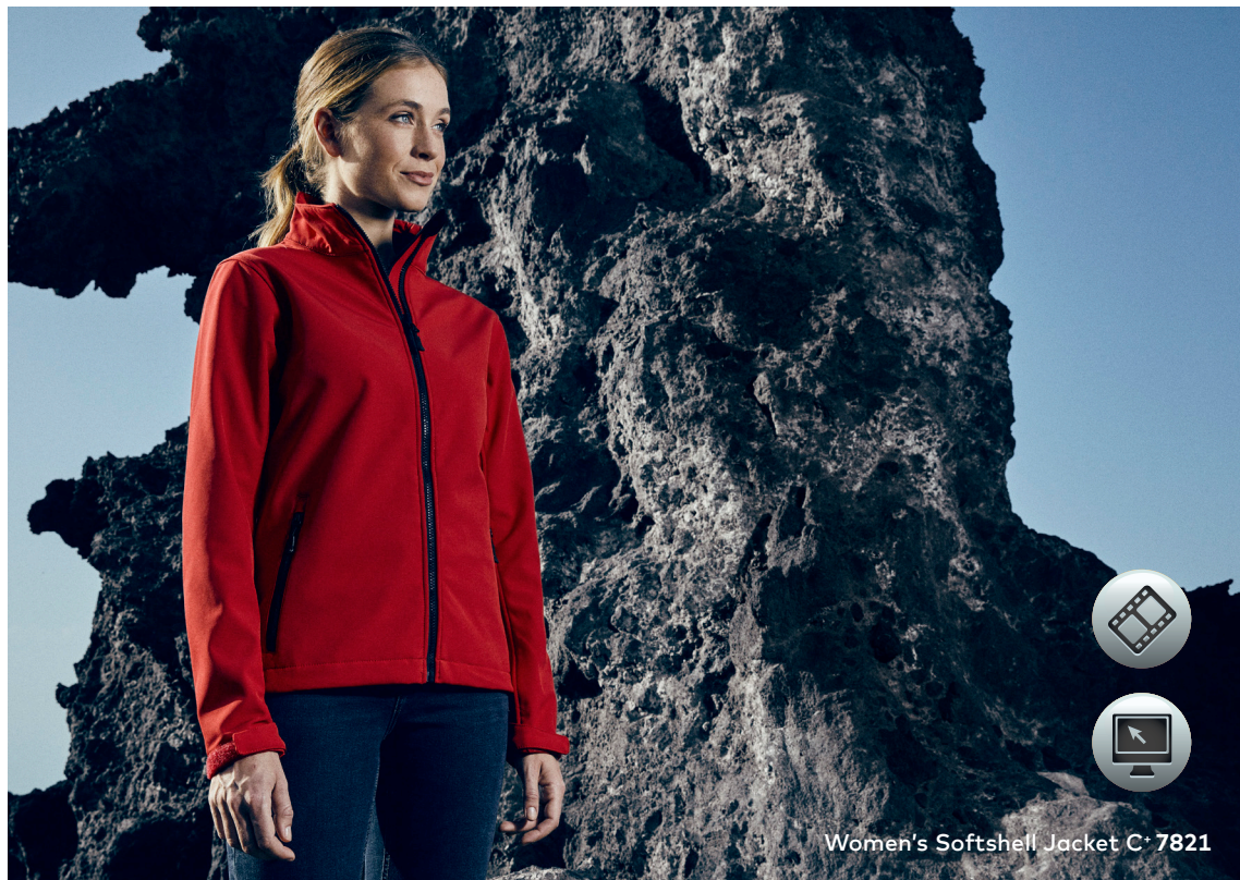
Women's Softshell Jacket C 7821