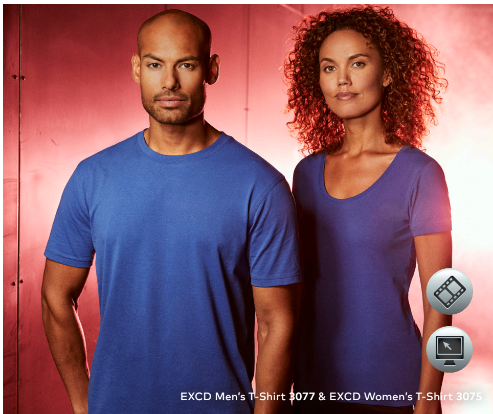
EXCD Men's T-Shirt 3077 & EXCD Women's T-Shirt 3075