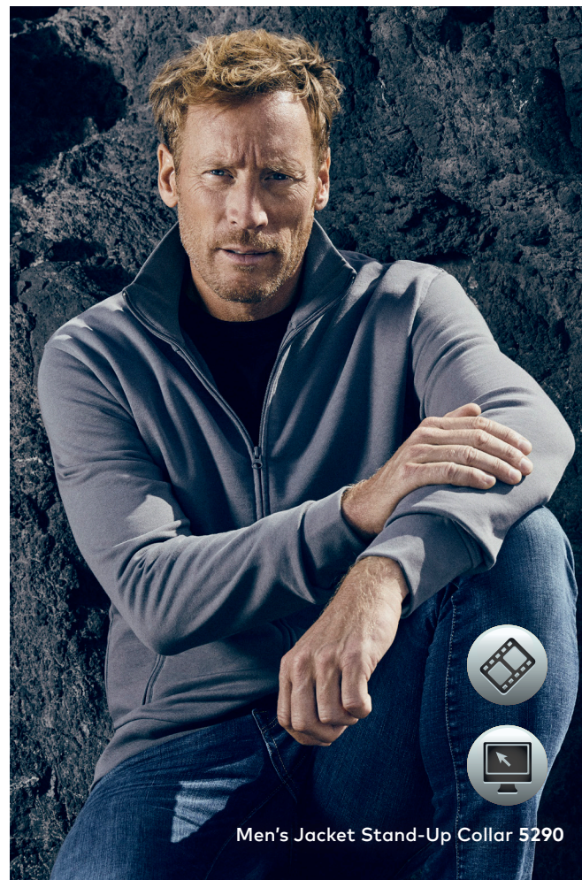
Men's Jacket Stand-Up Collar 5290

Classic molton sweatjacket, molton brushed inside, with elastane in sleeve cuffs and waistband, stand-up-collar, full-length, concealed tone-in-tone zipper as well as 2 front zip pockets, produced of combed cotton. The sweatjacket has a modern cut.