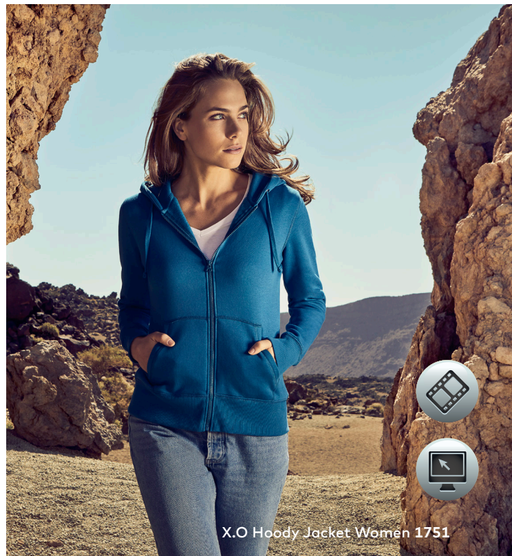
X.O Hoody Jacket Women 1751

Unique molton blend hooded sweat jacket with brushed inside, kangaroo pocket and elastane cuffs, sleeves and hem, made from long staple combed cotton and polyester. The particularly smooth surface and flowing fabric give the sweat jacket a unique, elastic and silky finish. The sweatshirt has a slim fit.