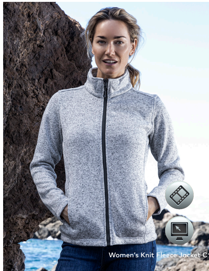
Women's Knit Fleece Jacket C +

Knitted fleece jacket with stand-up collar, brushed inside, full-length zip in contrast colour and 2 front side pockets as well as fixing for outer jacket, produced of polyester. The jacket has a slimmer cut. Jacket concept 6-in-1, combinable with outer jacket 7548/7549.