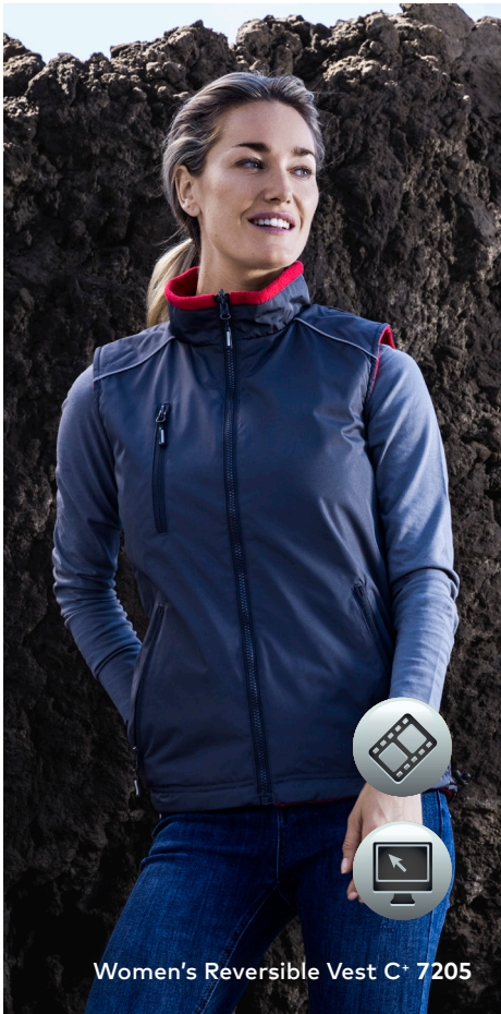
Women's Reversible Vest C+ 7205