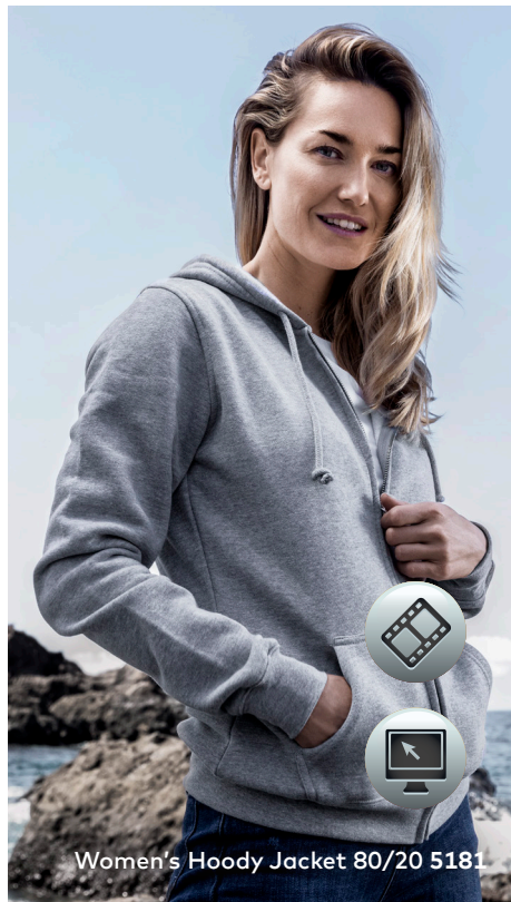
Women's Hoody Jacket 80/20 5181

Classic molton mixed fabric hooded sweatjacket, molton brushed inside, with elastane in sleeve cuffs and waistband as well as a pouch pocket, double hood and full-length and concealed nickel free metal zipper, produced of combed cotton with polyester. The hooded sweatjacket has a modern cut.