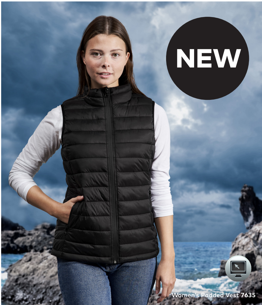
Women's Padded Vest 7635