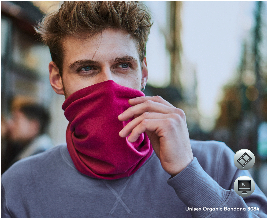
Unisex Organic Bandana 3084