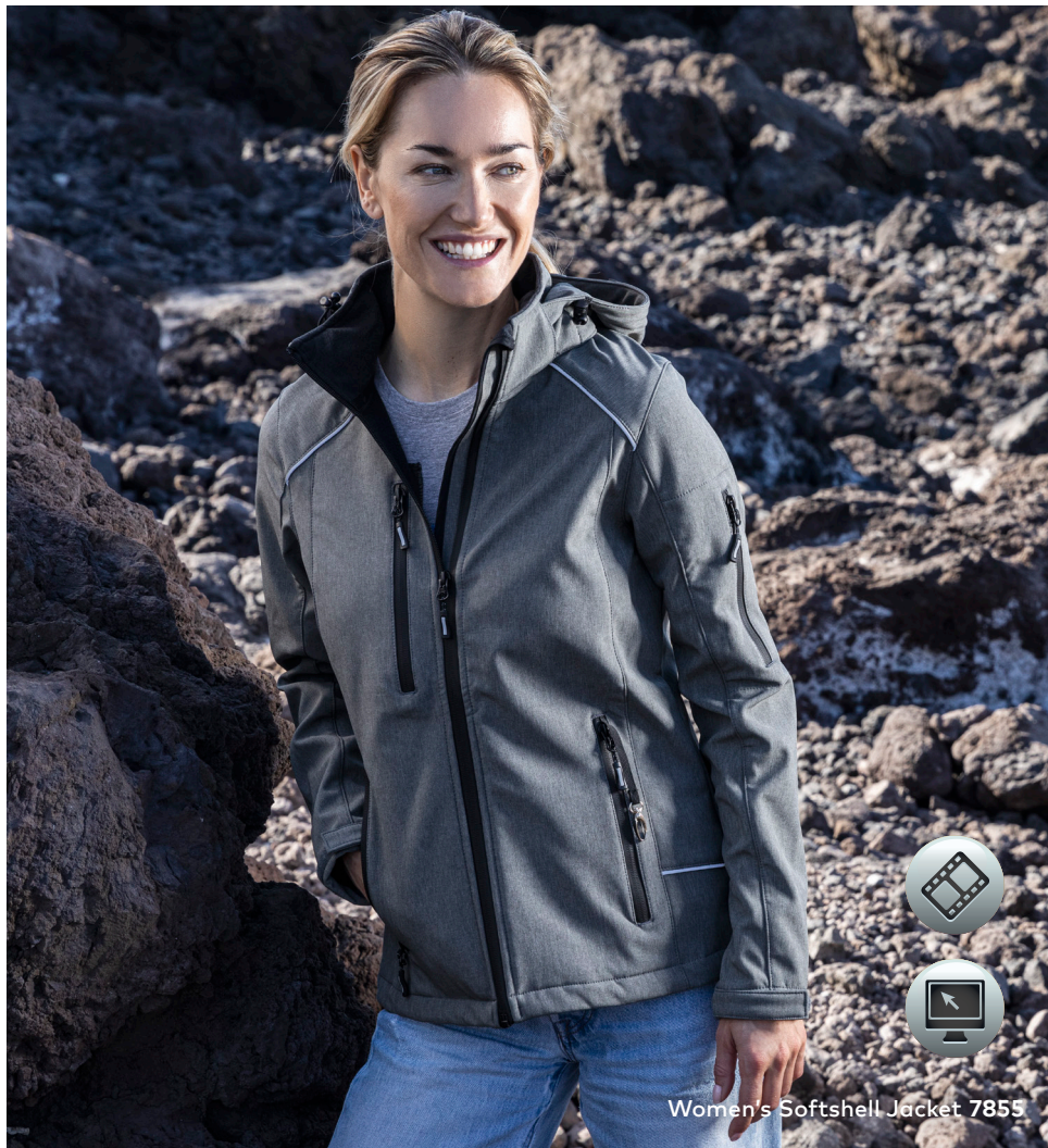
Women's Softshell Jacket 7855