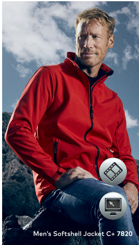
Men's Softshell Jacket C+ 7820

Softshell jacket. The specific features of this jacket: zip with rain and chin protection, adjustable sleeve cuffs with velcro fasteners, tunnel drawstring at hem with cord stoppers inside, 2 side pockets with zip, fixing for outer jacket, breathable, waterproof 8.000 mm, produced of bi-elastic bonded fleece from polyester with elastane for better comfort. The jacket has a sporty cut. Jacket concept 6-in-1, combinable with outer jacket 7548/7549.