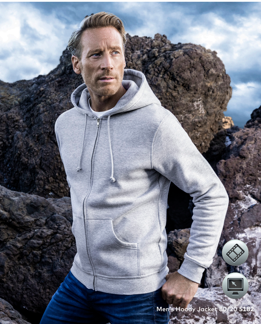
Men's Hoody Jacket 80/20 5182