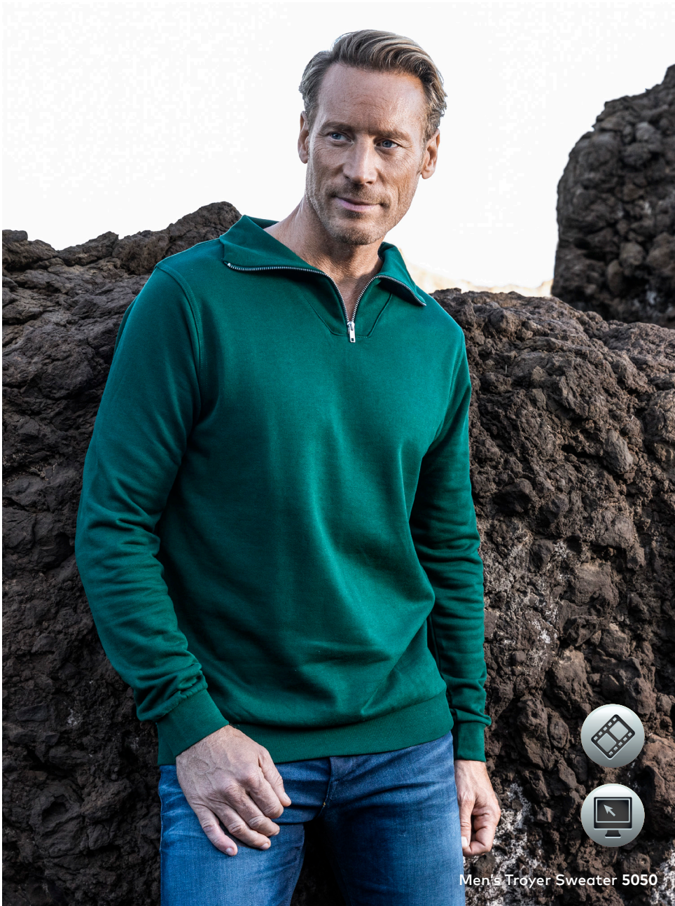
Men's Troyer Sweater 5050