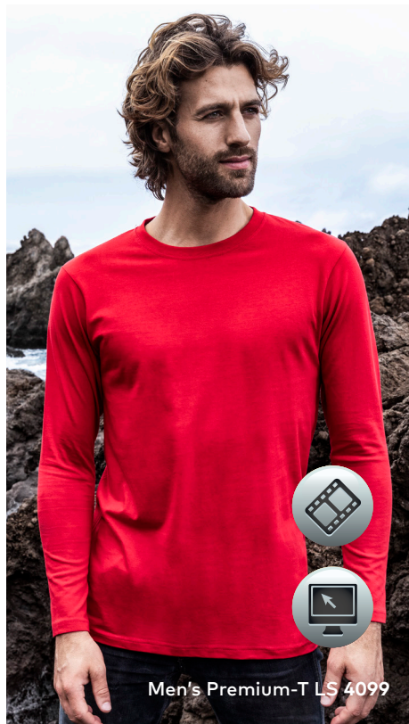
Men's Premium-T LS 4099

Classic single jersey longsleeve T-Shirt with elastane in small rib neckline, produced of long staple combed cotton, the particularly fine surface of the fabric is highly suitable for any kind of textile finishing. The longsleeve T-Shirt has a modern cut and is made from tubular fabric.