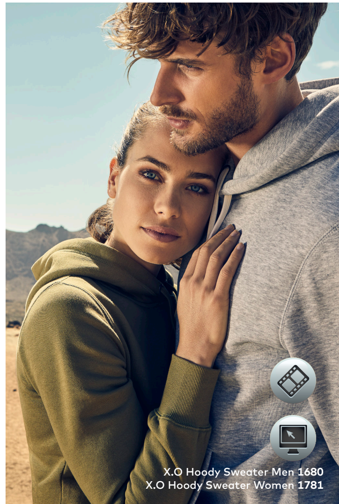
X.O Hoody Sweater Men 1680 X.O Hoody Sweater Women 1781

Unique molton blend hooded sweatshirt with brushed inside, kangaroo pocket and elastane cuffs, sleeves and hem, made from long staple combed cotton and polyester. The particularly smooth surface and flowing fabric give the sweatshirt a unique, elastic and silky finish. The sweatshirt has a slim fit.