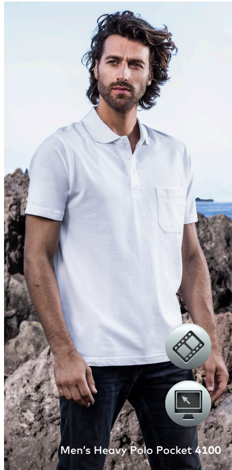
Men's Heavy Polo Pocket 4100

Timeless piqué polo with chest pocket and button panel with 3 tone-in-tone buttons, open sleeve cuffs and side slits, produced of combed cotton. The polo has a casual cut.