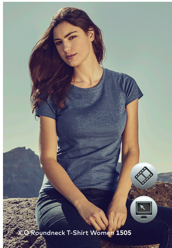
X.O Roundneck T-Shirt Women 1505

Unique single jersey T-shirt with self-fabric collar, made from long staple combed cotton. The particularly smooth surface and flowing fabric give the shirt a unique, elastic and silky finish. The T-shirt has a slim fit and is made with side seams.