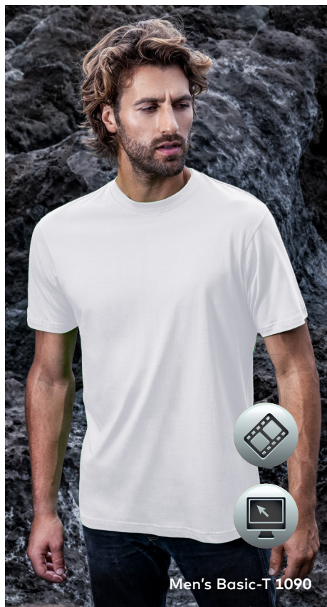
Men's Basic-T 1090

Timeless single jersey T-Shirt with elastane in rib neckline, produced of combed cotton. The T-Shirt has a classic cut and is made from tubular fabric.