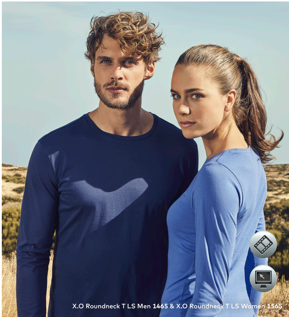
X.O Roundneck T LS Men 1465 & X.O Roundneck T LS Women 1565

Unique single jersey long-sleeved shirt with self-fabric collar, made from long-staple combed cotton. The particularly smooth surface and flowing fabric give the shirt a unique, elastic and silky finish. The T-shirt has a slim fit and is made with side seams.