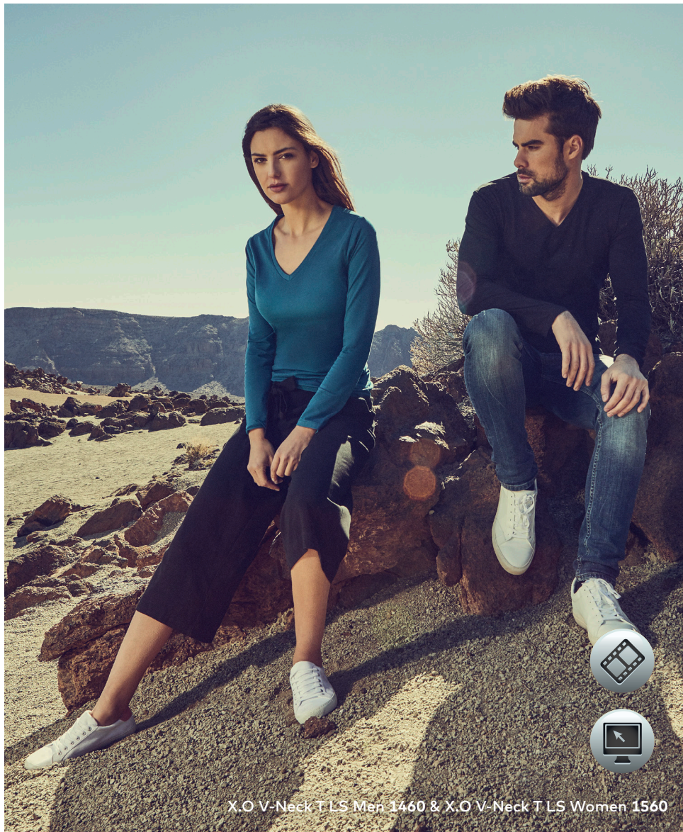
X.O V-Neck T LS Men 1460 & X.O V-Neck T LS Women 1560