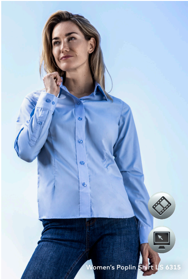
Women's Poplin Shirt LS 6315