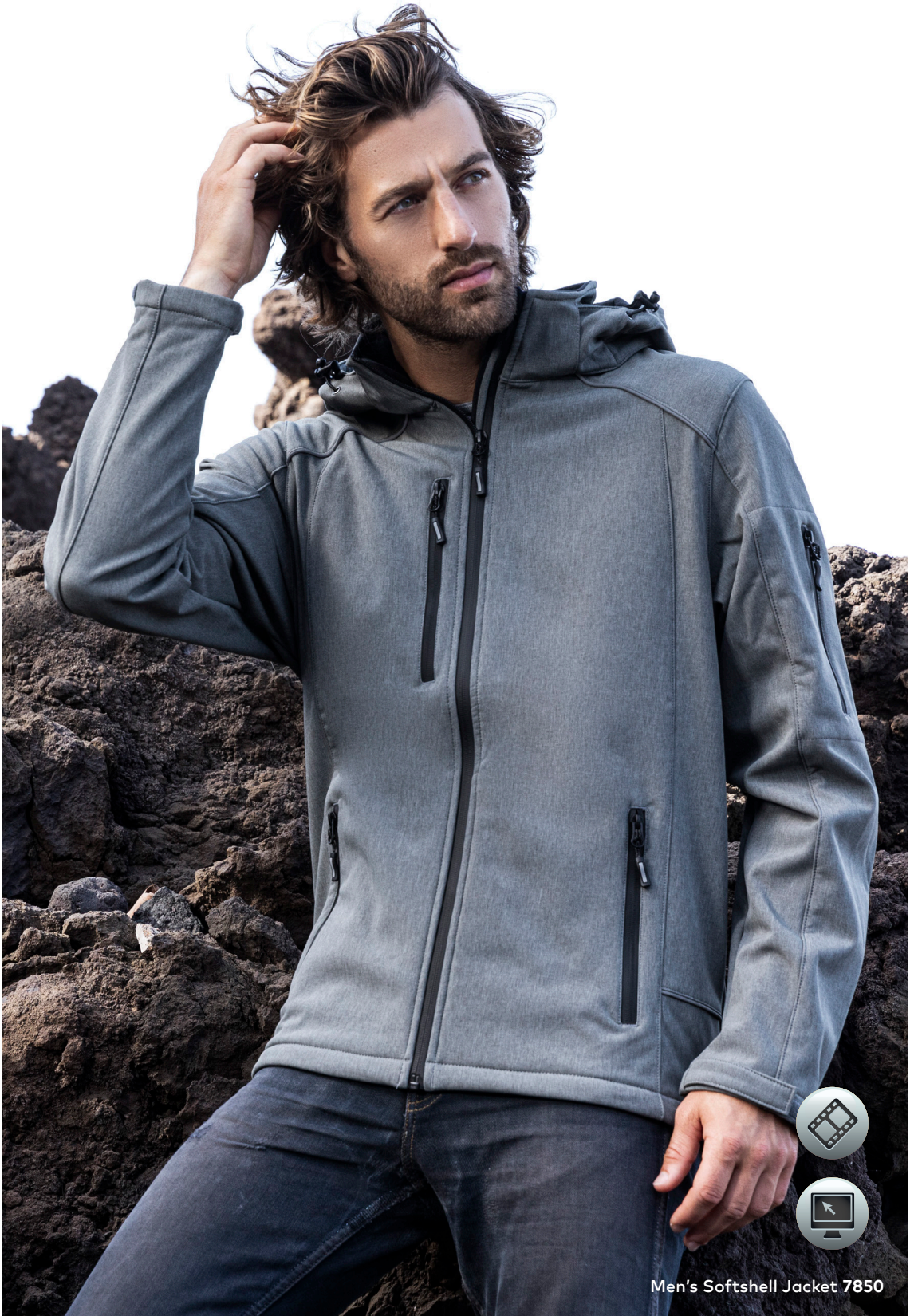
Men's Softshell Jacket 7850