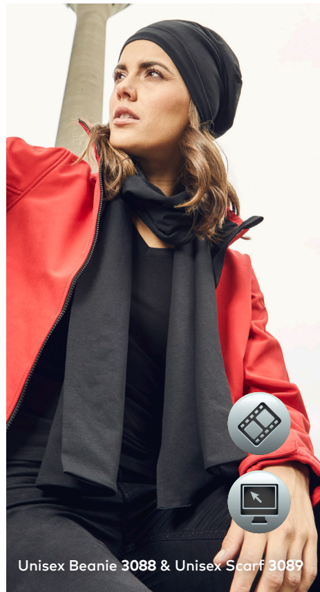
Unisex Beanie 3088 & Unisex Scarf 3089

Unisex single-jersey scarf, double layered, measurement 180 cm × 30 cm, tear-off label for easy removing, produced of combed cotton with elastane for better form stability.