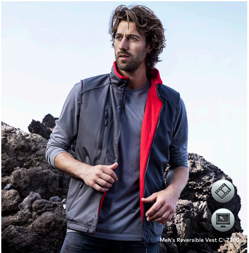
Men's Reversible Vest C+ 7200

Reversible vest, the specific features of this jacket: stand-up collar, napoleon pocket on front side, 2 side pockets with zip on the front-/inner side, sewed key ring in side pocket, reflecting piping and zip pullers, tunnel drawstring at hem with cord stoppers, curved hem, invisible zip for decoration, fixing for outer jacket, fleece inner side with anti-pilling-finish, produced of polyester. The vest has a modern cut. Jacket concept 6-in-1, combinable with outer jacket 7548/7549.