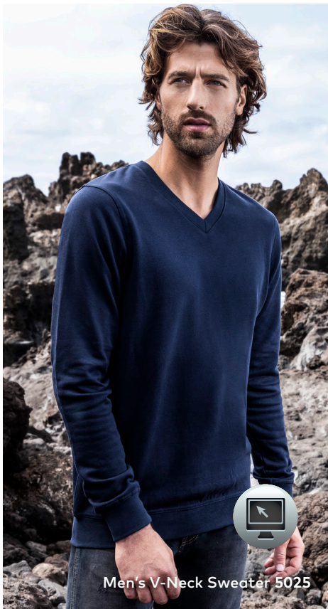
Men's V-Neck Sweater 5025