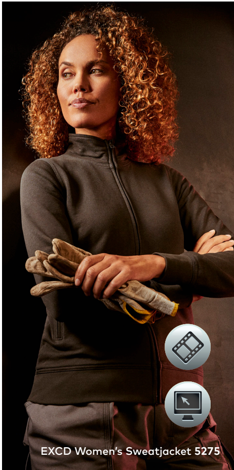
EXCD Women's Sweatjacket 5275