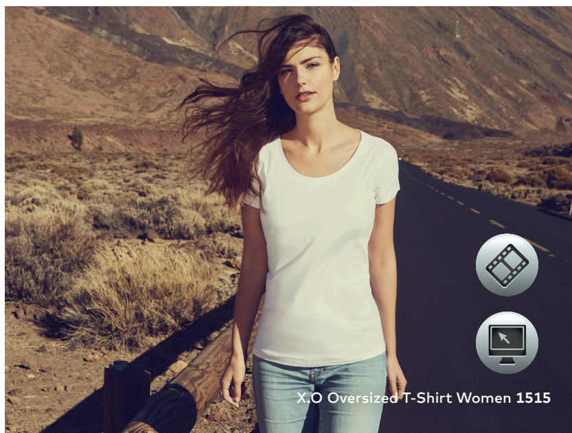
X.O Oversized T-Shirt Women 1515