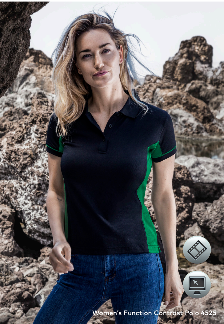
Women's Function Contrast Polo 4525