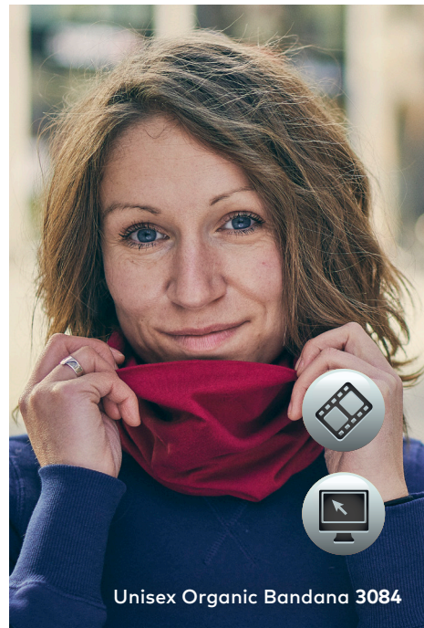
Unisex Organic Bandana 3084

Single jersey bandana, 2-layers, produced of long staple certified (organic) cotton with elastane for better form stability and better comfort. The bandana offers different wearing possibilities. Measurements: S (child) approx. 24 × 23 cm, L (adult) approx. 26 × 25 cm. The bandanas are excluded from exchange.