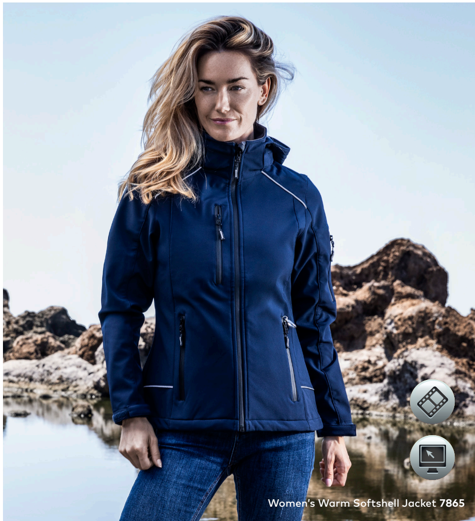
Women's Warm Softshell Jacket 7865