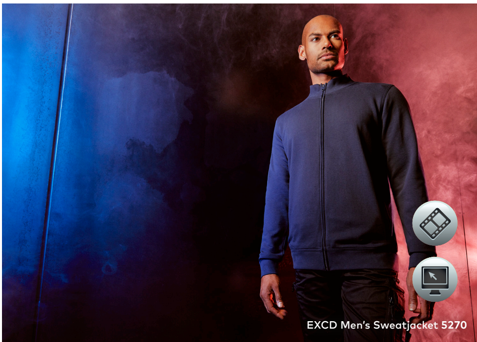
EXCD Men's Sweatjacket 5270