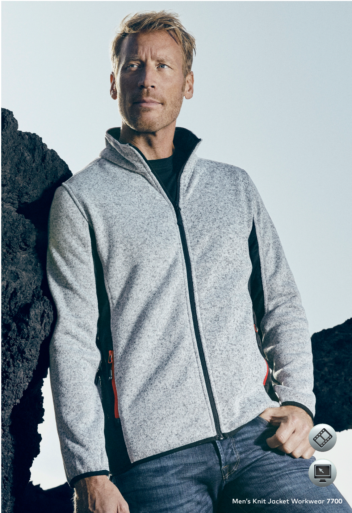
Men's Knit Jacket Workwear 7700