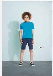
REGENT KIDS 11970