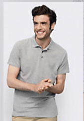
SOL'S SPRING II 11362