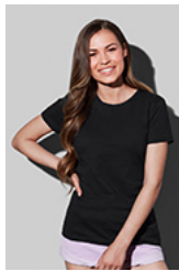
ST2600 Classic-T Fitted