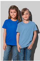
ST2200 Classic-T Kids