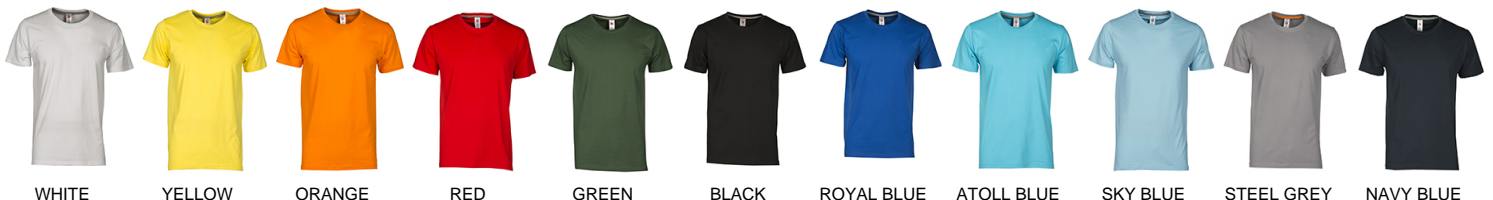
WHITE YELLOW ORANGE RED GREEN BLACK ROYAL BLUE ATOLL BLUE SKY BLUE STEEL GREY NAVY BLUE