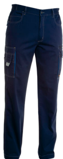
NAVY BLUE/ROYAL BLUE