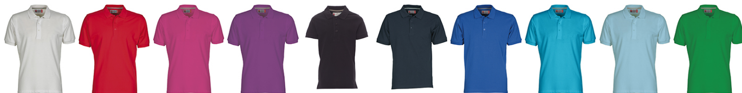
WHITE RED FUCHSIA SUMMER VIOLET BLACK NAVY BLUE ROYAL BLUE ATOLL BLUE AQUAMARINE JELLY GREEN